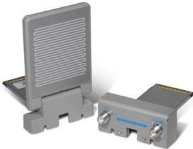
Figure 1. Cisco Aironet 1200 Series Access Points 802.11a Radio Modules

All available radios (802.11a, 802.11b, and 802.11g) provide a variety of transmit power settings to adjust coverage area size. To extend the flexibility of deployments, the 802.11a radio module is available in two versions (Figure 1). Both versions provide up to 12 nonoverlapping channels in the 5 GHz band (subject to local regulations); an additional 11 will become available in 2005 with a field firmware upgrade. One version offers dual antenna connectors for use with a wide variety of Cisco antennas to achieve extended range and application-specific coverage. The second has an integrated antenna design that incorporates diversity omnidirectional (5 dBi) and patch antennas (9 dBi). For ceiling, desktop, or other horizontal installations, the integrated omnidirectional antenna provides an optimal coverage pattern and maximum range. For wall-mount installations,